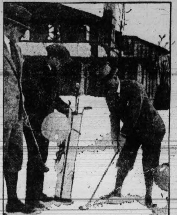
When a golfer is determined to play, snow can't block him. These golfers at the Westchester Biltmore Country Club, Rye, N. Y., have attached balloons to their golf balls, so they can tell where the balls drop. Yes, they admit the balloons retard the drive a little.